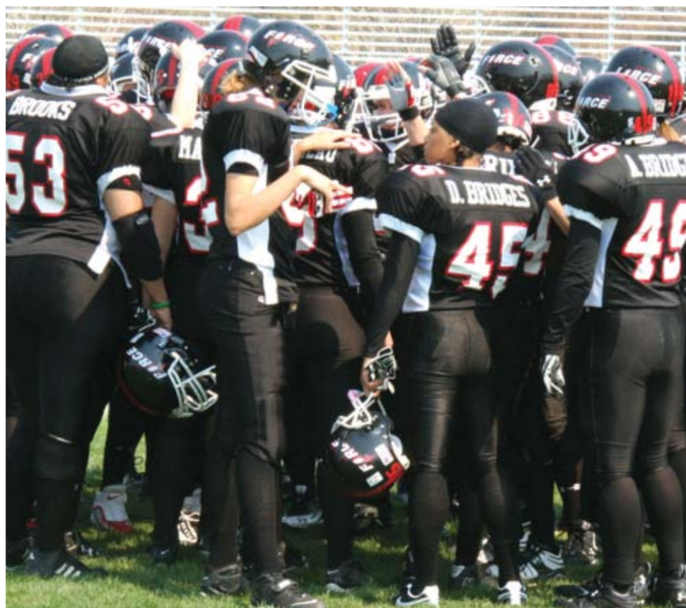
The Chicago Force after a game last year.